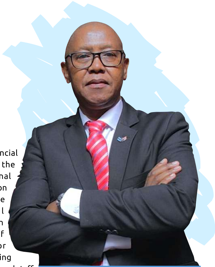
Hon. Dr Thapelo Matsheka Minister, Finance & Economic Development

The Fund provides financial resources to cater for the procurement of national relief supplies; evacuation cost for citizens outside Botswana; national publicity outreach programmes; relief of selected industries or sectors; public counselling centers or facilities; additional staff to support health professionals and an economic stimulus package post COVID-19 Pandemic.